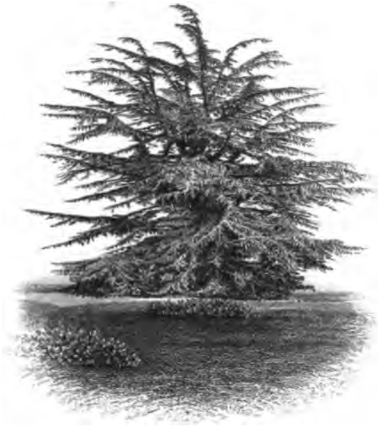
CEDAR AT FARRINGFORD